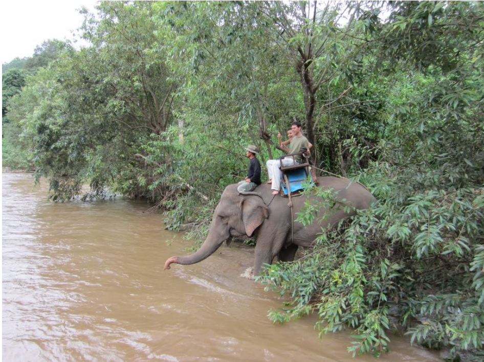
Elephant Camp with nature ride, performances