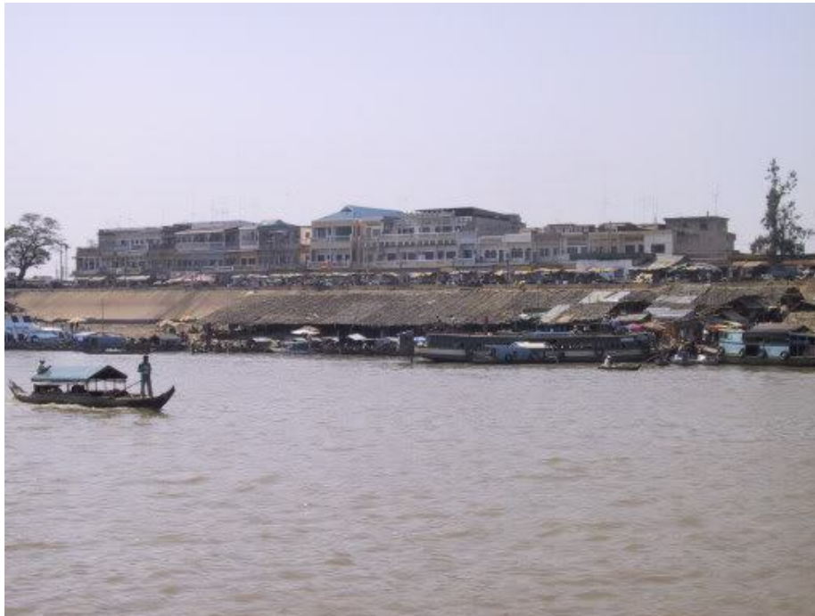
Sunset cruise on the Mekong River